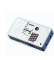
Carbon Monoxide Sensor